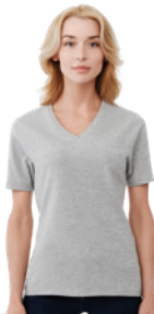
KAWARTHA 38016 / 38017