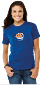
NANAIMO 38011 / 38012