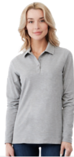
OAKVILLE 38086 / 38087