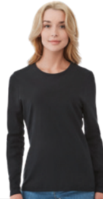
PONOKA 38018 / 38019