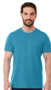
JADE 37500 / 37501