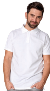
GRAPHITE 37508 / 37509