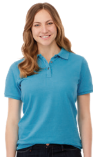
BERYL 37502 / 37503