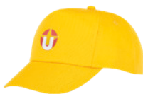
FENIKS KIDS 38667