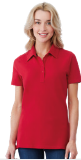
MARKHAM 38084 / 38085