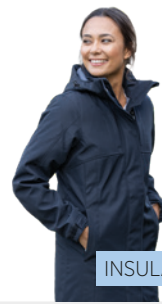
KEEFE NEW 38331