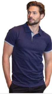
MORGAN 38110 / 38111