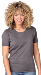
AZURITE 37506 / 37507