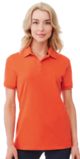
CALGARY 38080 / 38081