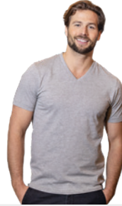
SOMOTO 38030 / 38031