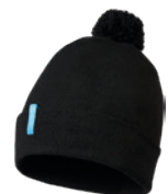
OLIVINE NEW 37531