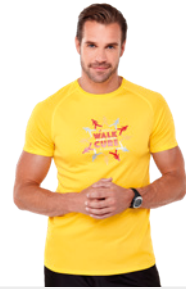
NIAGARA 39010 / 39011