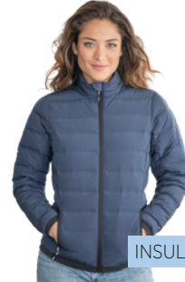
FAIRVIEW 39420 / 39421