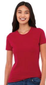
BALFOUR 38024 / 38025