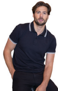
AMARAGO 38108 / 38109